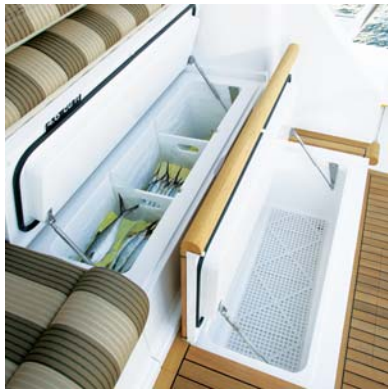
■ Cleared for action, the 160 square-foot cockpit packs an arsenal of fishing features. Shown with optional teak.